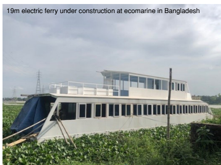
19m electric ferry under construction at ecomarine in Bangladesh

Clients can be individuals who are building boats for themselves, shipyards or owners that are looking for a design solution or even other ship design offices that need some help in times of peak loading. Thanks to the firm's unique flexibility it is able to offer a truly innovative solution that meets its varied clients' individual needs.