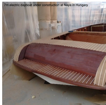
7m electric dayboat under construction at Naya in Hungary

and even with electric propulsion. As such, the team at Naviculus draw on their vast industry experience to offer clients a truly innovative solution.